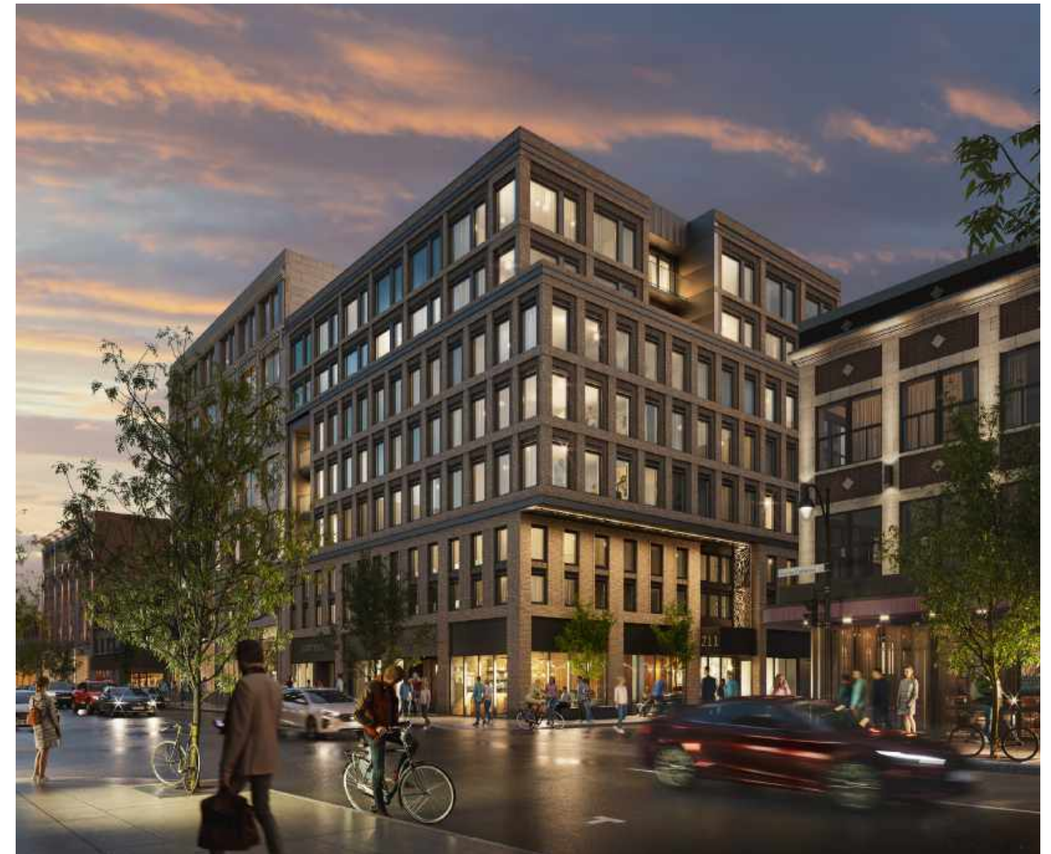
Exterior building facing Sainte-Catherine Street.

The timeless architecture of the Eli Condos building is very much a reflection of this trend and integrates into the urban landscape with a modern and original design inspired by street art.