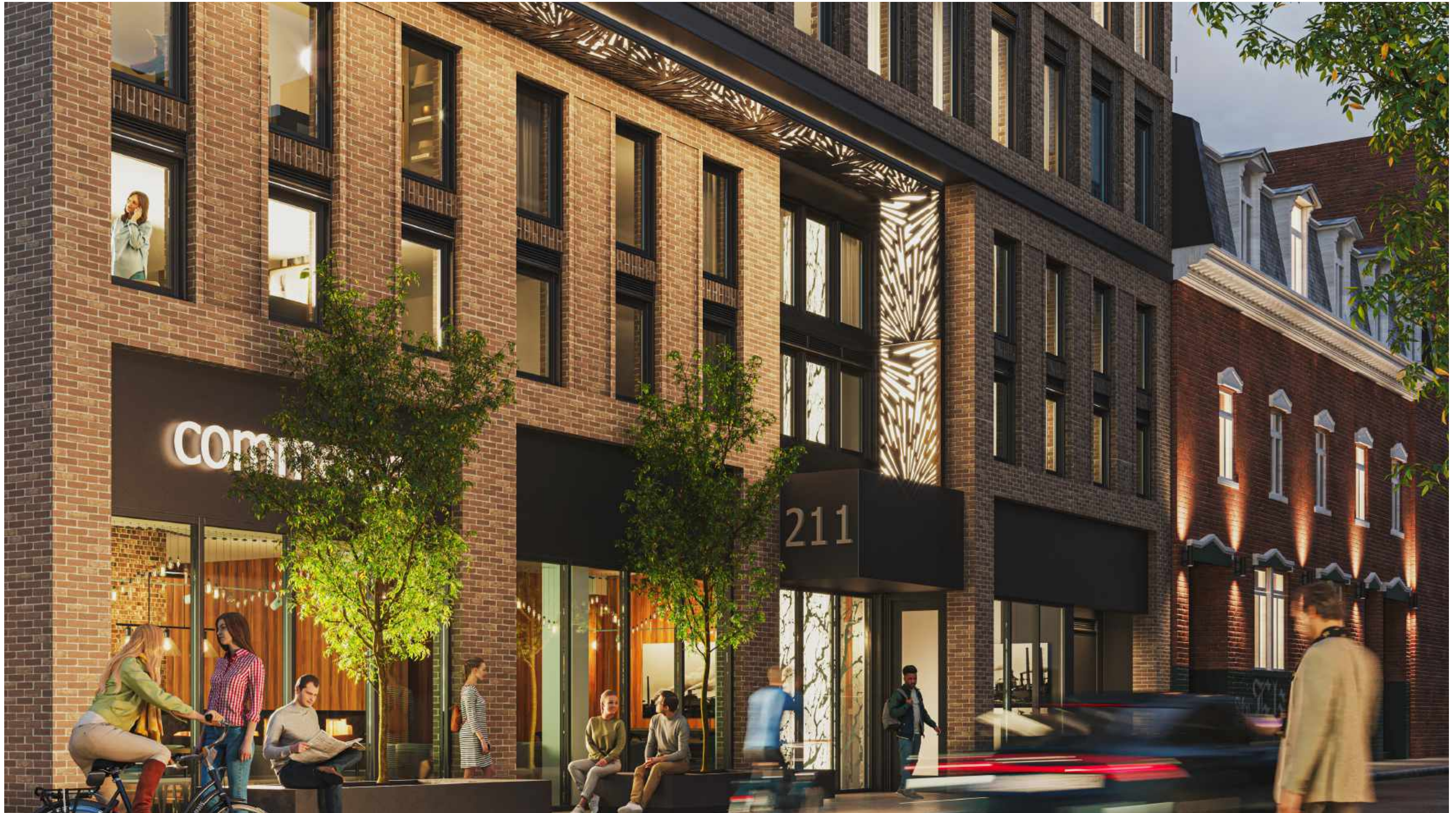
Exterior building facing Sainte-Elisabeth Street.